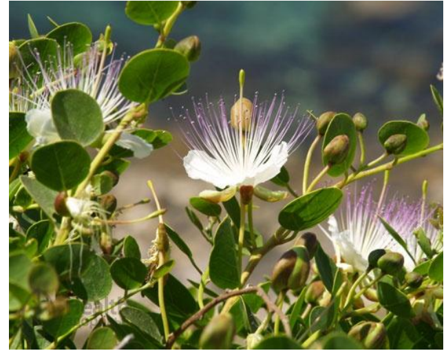
Capparis spinosa L.