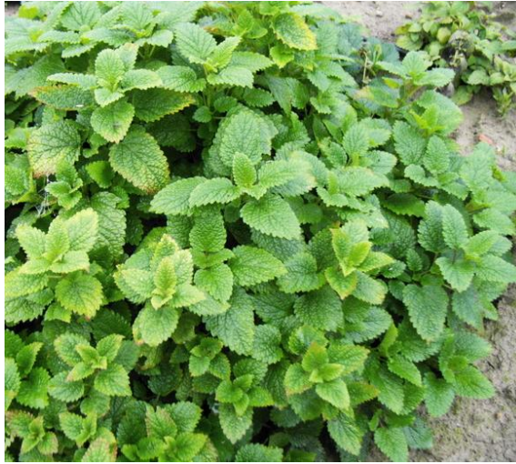
Melissa officinalis L.