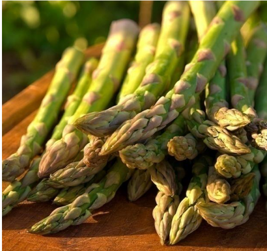
Asparagus officinalis L.