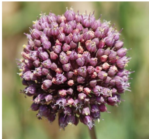
Allium ampeloprasum L.