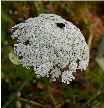
Daucus carota L. (wild carrot)