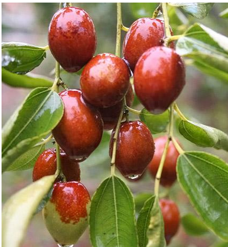
Zizyphus jujube Mill.