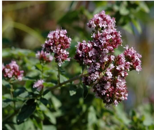
Origanum vulgare L.